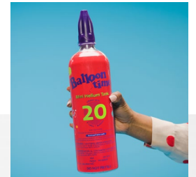
2 lb. Helium Cylinder